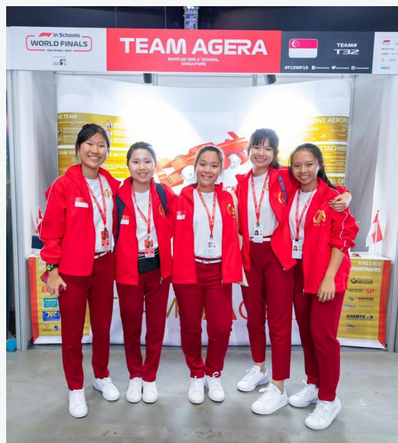
My F1 in Schools team, Team Agera, in front of our Pit Booth Display during the World Finals 2019 held in Abu Dhabi.

"It sounds very tempting to be involved in a hundred and one different programmes, but when you are up to your neck having to handle everything and you feel like you cannot cope, you might regret your decision. Aim for a comfortable amount of commitments - a manageable amount that is also enough to stretch you."