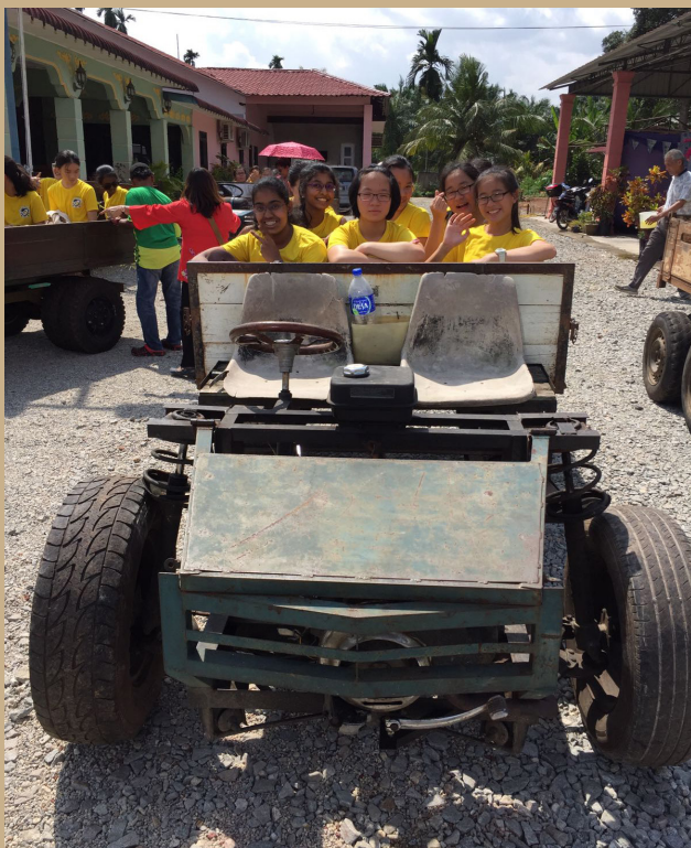
Oh what fun it is to ride on a... farm vehicle! Using the farm vehicle as their mode of transport, students had the chance to visit cottage industries in Johor as part of their learning journey experience.

As part of Learning Journey Week 2017, students had the chance to venture out of their classrooms to different parts of Singapore and neighbouring Malaysia to learn more about the issues and implications in their external environment. For the Year 1s, 3s and 4s, their learning journey centred on helping them understand more about the Singapore Story, while the Year 2s explored parts of Malaysia in hopes of better understanding and appreciating Singapore and the region as part of the Regional Immersion and Community Exploration (RICE) Programme.