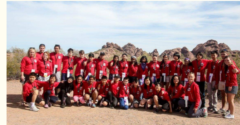
The 2016 Broadcom MASTERS international delegation in Arizona.

"Last year, as part of the Broadcom MASTERS International delegate, I had the chance to have a taste of what the Intel ISEF is all about. The environment there is very bustling – everyone wants to show the world what they've done and it felt good to be a part of something that I feel very passionate about. Everyone there had such great ideas on how they want to change the world with science, which is very inspiring. Being able to be a part of that environment again is what I'm most looking forward to at the Intel ISEF."