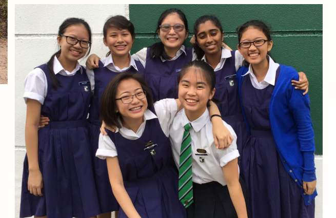
My close friends never fail to brighten up my school life!

"I've really enjoyed being a student at RGS. The thing that I really love the most is the culture here – it's very vibrant and there's so much school spirit. Even though sometimes people may think that we are very different because we're in an all-girls environment, and that our programmes have a certain level of rigour, I think that's what makes RGS, RGS. We are also provided with a lot of different opportunities to learn through numerous platforms outside the classroom, and the teachers are very inspiring and passionate."