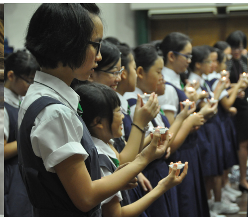
The passing of the flame symbolises how the Rafflesian spirit has sustained through generations and passed down from senior to junior, sister to sister.