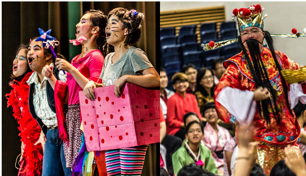
Lunar New Year celebrations: (left) Students from the Chinese Drama performing arts group's energetic performance of contestants in a mock singing competition left audiences saddled in laughter, (right) while a surprise visit from the God of Fortune ended the celebrations on a high.

RAFFLES GIRLS' SCHOOL Nurturing Daughters of a Better Age