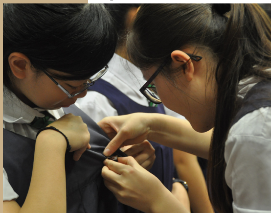
During the Badge Initiation Ceremony, each Year 1 girl receives her school badge for the very first time, and has it pinned on their uniforms by their Year 4 seniors.

With the start of the new school year, RGS welcomed a new batch of Year 1s. To address first-day jitters, help the new students prepare for a successful year and experience what it means to be a Rafflesian, the Year 1 Orientation Programme was packed with activities such as ice-breaker games, a Badge Initiation Ceremony and an overnight camp, which culminated in a concert specially for the parents of the new Rafflesians.