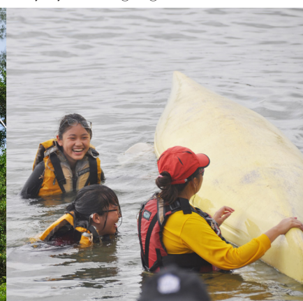
At OBS, students embark on expeditionary activities such as rope confidence courses, kayaking and trekking. These activities require students to constantly deal with unfamiliar situations and adapt to changes.