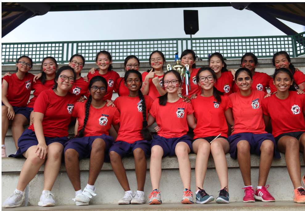
The highly-anticipated Sports Fest 2017 was held at Serangoon Stadium and Rafflesians played, ran and cheered hard for that coveted champion's trophy. In the end, it was the Hadley house cheerleaders who emerged top for the Inter-House Cheer cum Dance Display Competition, while Tarbet fought their way back to the top spot to be crowned overall champions for Sports Fest 2017!