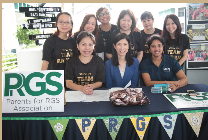
Our amazing group of parent volunteers from the Parents for RGS Association, who supported the event by sharing useful information and their experiences with visitors and selling merchandise to raise funds for our new campus.

A welcome departure from the usual wet weather during past instalments of the RGS Open House, the sun was shining and the skies were clear as 4,205 visitors streamed into RGS on 20 May 2017 for a taste of the RGS experience. Activities and talks were lined up throughout the day, and information booths and displays were aplenty. Visitors were also treated to performances by our CCA groups, and the enthusiastic mass dance and cheers by our Year 1 students and cheerleaders from the five houses. To view more RGS Open House 2017 photos, please click here .