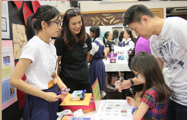
Visitors getting a hands-on experience on how learning takes place in the Raffles classroom at our interactive booths.

A welcome departure from the usual wet weather during past instalments of the RGS Open House, the sun was shining and the skies were clear as 4,205 visitors streamed into RGS on 20 May 2017 for a taste of the RGS experience. Activities and talks were lined up throughout the day, and information booths and displays were aplenty. Visitors were also treated to performances by our CCA groups, and the enthusiastic mass dance and cheers by our Year 1 students and cheerleaders from the five houses. To view more RGS Open House 2017 photos, please click here .