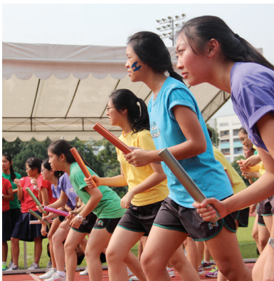
Participants of the Class of 2014 8x50m Relay all set for the race.