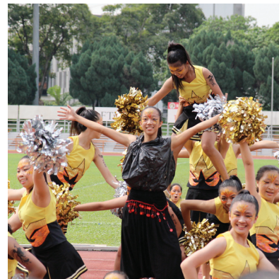
For their outstanding performance titled Waddle Wildfire , Waddle House won the Inter-House Cheer cum Dance Display Competition!