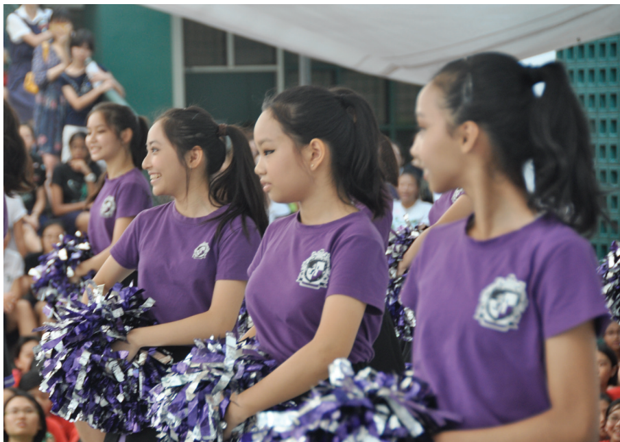
Hadley House cheerleaders warming up with their cheer cum dance performance during Open House 2014.