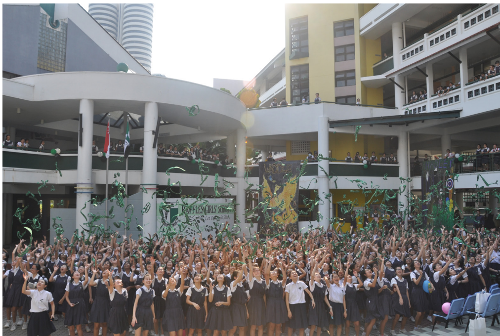
Farewell & Graduation Assembly 2014 - Click here to view a tribute video.

RAFFLES GIRLS' SCHOOL Nurturing Daughters of a Better Age