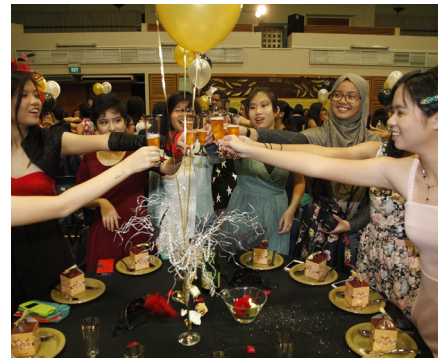
Cheers to long-lasting friendships and memories forged over the past four years and to exciting, new beginnings ahead!

All the best to our graduating class of 2014! May you continue to shine bright wherever you may be, fulfill the promise of your potential and make a difference in society, community and nation.