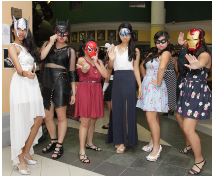
The girls dressed to the theme for the evening, Masquerade.