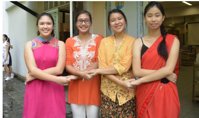
Different Stories, One Heartbeat marks the theme for this year's Racial Harmony Day celebrations.

In conjunction with Mother Tongue Fortnight, RGS celebrated Racial Harmony Day (RHD) on 21 July 2016. It was a day when the RGS community came together to explore and revisit the stories of our own culture, and to embrace other cultures' differences as well in a bid to celebrate diversity as one Rafflesian family. Activities such as a song-writing workshop, rangoli and kolam workshops, a xin yao concert and a Malay folk dance workshop were organised to give an insight into the culture and heritage of the different races in Singapore. One of the highlights of RHD celebrations each year is also the activities and food stalls set up by our wonderful parent volunteers of the Parents for RGS Association, where staff and students get the opportunity to indulge in traditional food (some even home-cooked!) and activities of the various cultures.