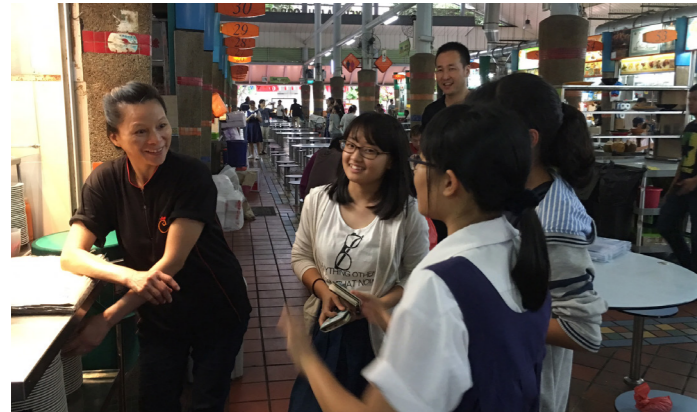
During their visit to a hawker centre, SJSS students had the opportunity to interact with local hawkers using the basic greetings taught by RGS students.

RGS has embarked on a collaborative project with the Singapore Japanese Secondary School (SJSS) in a series of inter-cultural exchanges in the form of lessons and immersion in the local Singapore culture. As part of the project, our students spend time teaching the Japanese students basic Mandarin, and engage them in immersion activities such as an experiential visit to a hawker centre, which is part of Singapore's unique culture and heritage.