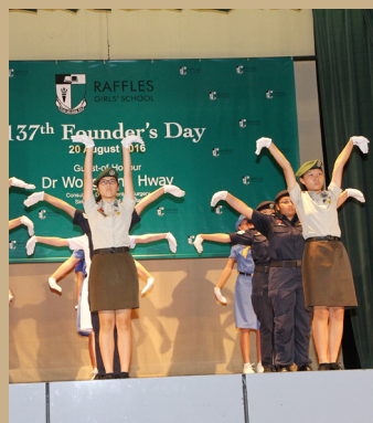
The five RGS Uniformed Groups - Girl Guides, Girls' Brigade, National Cadet Corps, National Police Cadet Corps and Red Cross Youth - wowed the audience with a spectacular display of fancy drills as they marched to the beats of popular songs.