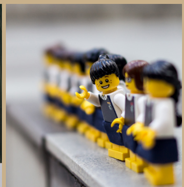
In a move to get RGS alumnae from all parts of the globe connected, the 'RGS Girls Around The World Campaign' was also officially launched by the RGS Alumnae on this day. For more information on the campaign, please click here .