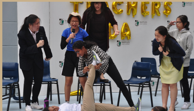
How many 'teachers' can you recognise in this photo?