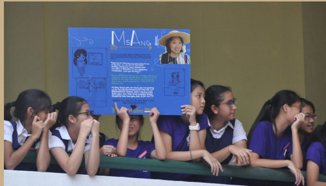
Student-fanclubs held up self-made posters for their superstar-teachers to cheer them on as they made their grand entrance into the Amphitheatre.

Captivating performances, a surprise item and rapturous cheering was the order of the day on 30 August, when students spared no effort to make their teachers feel like the superstars that they are on Teachers' Day. One of the performance items - a hilarious skit put together by the students from both English Drama and Chinese Drama - drew much laughter from their teachers as some of them found themselves parodied to a T by the student actors.