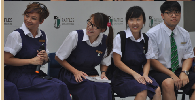
A dramatic end to the celebration turned out to be a surprise skit by our talented teachers, who 'got into trouble' for turning up late for school!