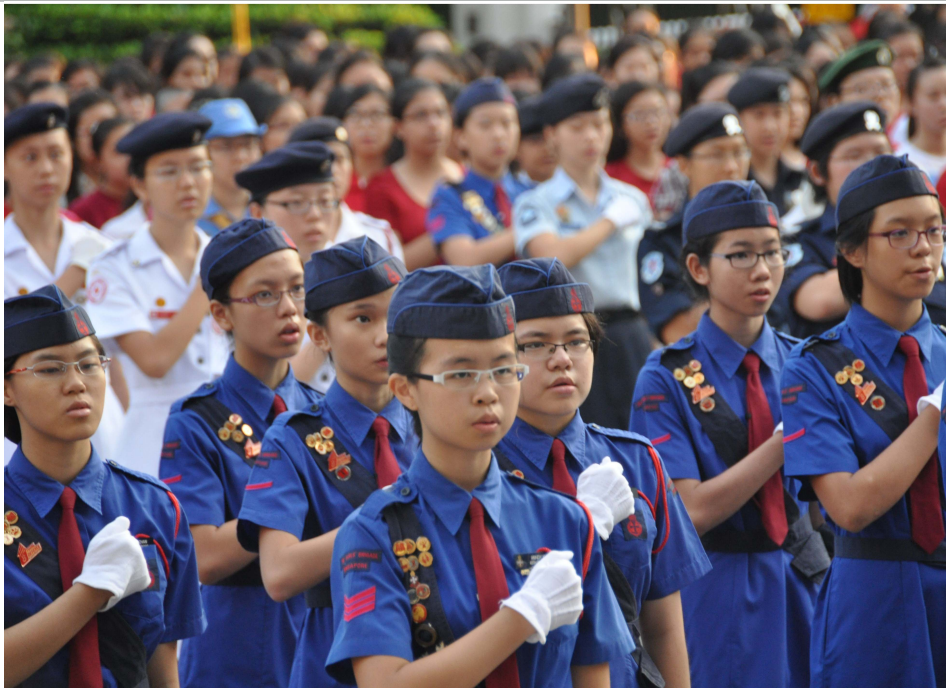
RGS National Day Celebrations