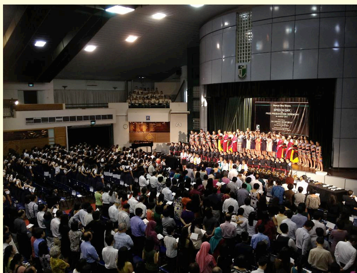
RGS Speech Day ceremony at the Evelyn Norris Hall