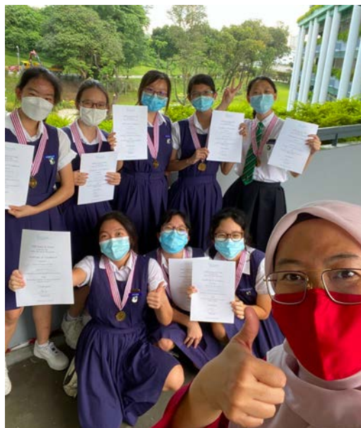
Project Mindflayer after Nationals FPSP Finals 2021!

"The strength of the RGS sisterhood is definitely what most of us treasure the most after the 4 years, because they not only left moving memories, but also a renewed maturity in how we perceive strength. I've discovered so much through working in all the teams I've been in, like my CmPs group Project Mindflayer, and in the Triple C Programme, and come to prioritise the personal connections and emotional depth from interactions more than tangible results. In that regard, RGS has made me - and many of us, who were conditioned to believe strength was standing alone - much more human, and I'm forever thankful."